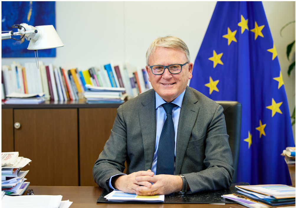
Nicolas Schmit, EU Commissioner for Jobs and Social Rights

This report by CEPES will certainly be a very welcome and thought-provoking inspiration for Member States to draw upon when implementing the future Council Recommendation. We should take every opportunity we can to share best practice and learn from each other.